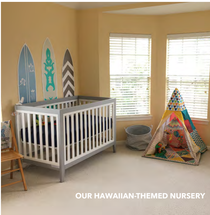
OUR HAWAIIAN-THEMED NURSERY