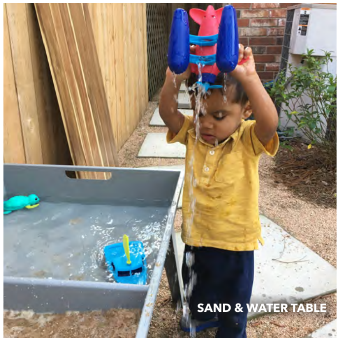
SAND & WATER TABLE