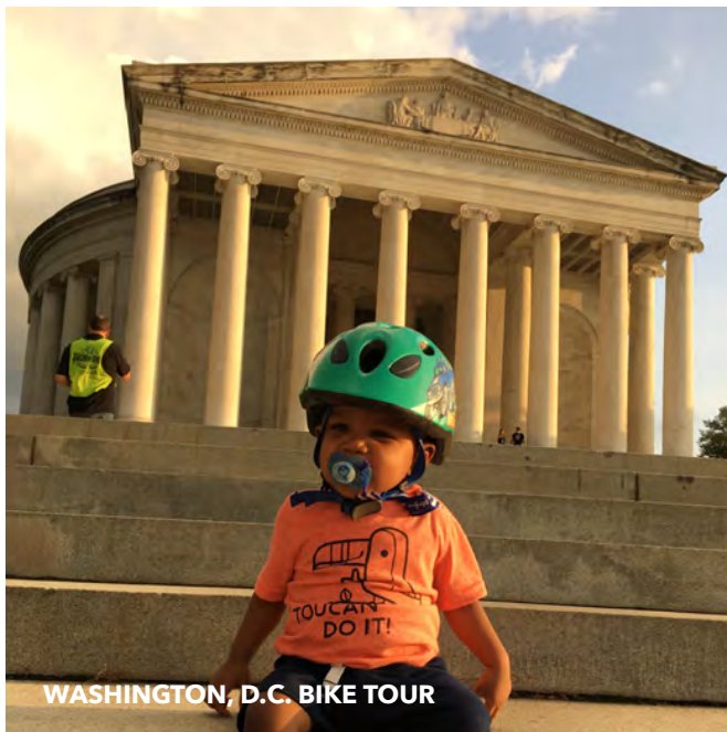
WASHINGTON, D.C. BIKE TOUR