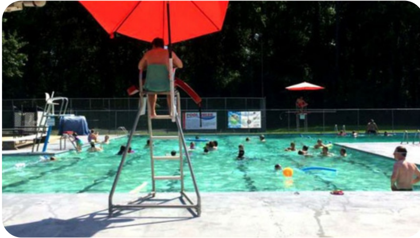
Our community pool