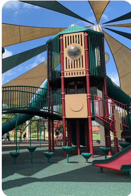
Our local playground

We have several local parks that we like to visit around our area. We are also a member of a community pool that we frequently go to during the summer. Our kids have always really enjoyed going to the pool and they have been on the swim team. All of our children are excellent swimmers. Teaching them to swim well has always been important to us. We have started them all in swim lessons when they were young. We have made sure they understand the importance of water safety.